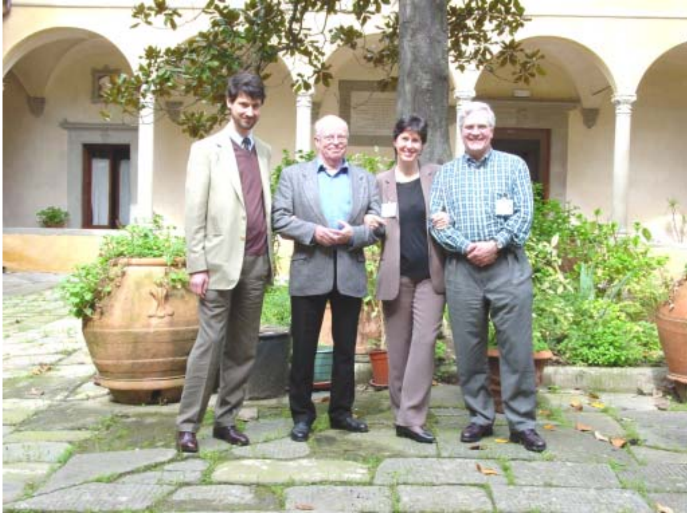
Keller Windup Fiesole 2001