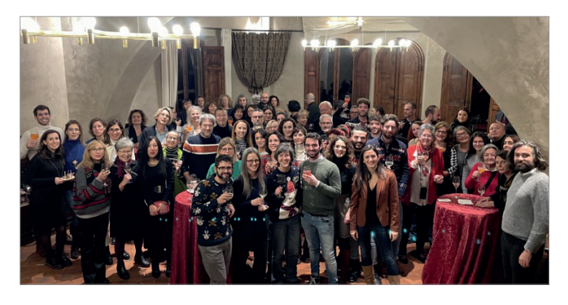
... As well as hosting November's symposium on the future of European libraries, it was also the venue for our Christmas party!