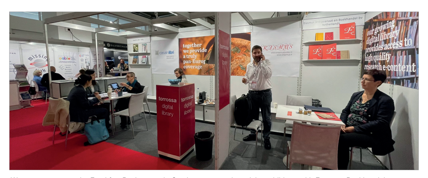
We were present at the Frankfurt Buchmesse in October, once again as joint exhibitors with Erasmus Boekhandel.

The 2024 Torrossa Retreat will take place on Thursday 18th April at the Teatro di Fiesole. More information can be found at www.torrossaretreat.org.