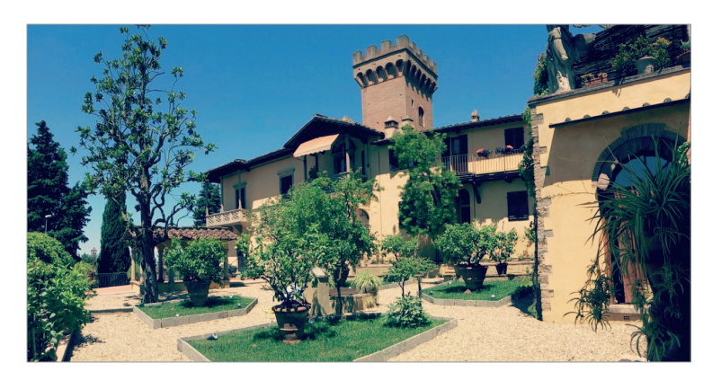
After 65 years, Villa La Torrossa may no longer house our offices but it still plays an important part in our identity and events...