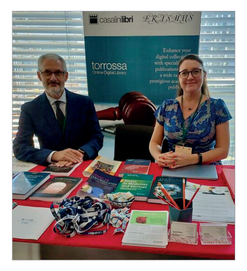
In attendance at the International Association of Law Libraries Annual Course in Geneva.

We continue in taking forward our mission to provide the best and widest possible access to scholarly content, with the continuing growth of our Torrossa Open collections of digital content in open access, and to support libraries and research institutions in the procurement and management of digital content with a focus on interoperability; we are currently working on the implementation of the COUNTER 5.1 standard and look forward to making it available to our customers soon.